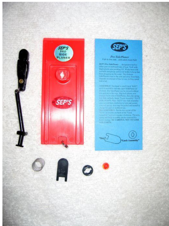
All the necessary parts of the Pro Side Planer.

Use SEP'S Pro Side Planer to intercept fish that are spooked to the side of your trolling boat/motor. The fluorescent red color of SEP'S Pro Side Planer, plus the simple and ultra-light design make it a favorite with trout and kokanee anglers. The lure/grub is slowly trolled to the side of the boat, just five feet below the surface, simple and effective, sideplaners put offerings where the fish are, without spooking them.