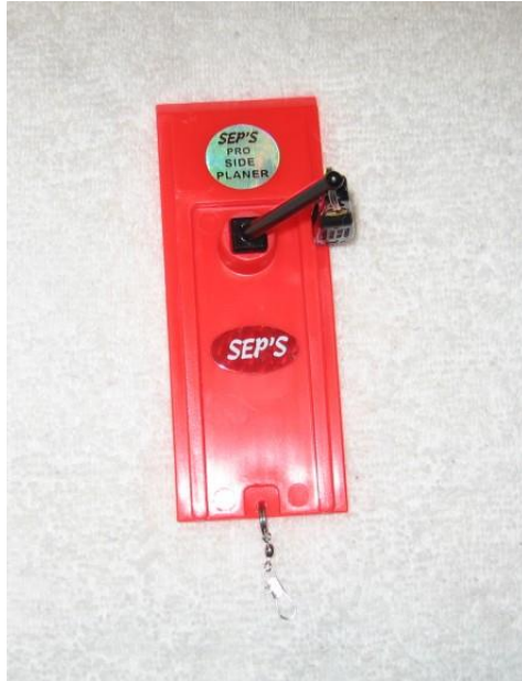
Rigged for starboard side.