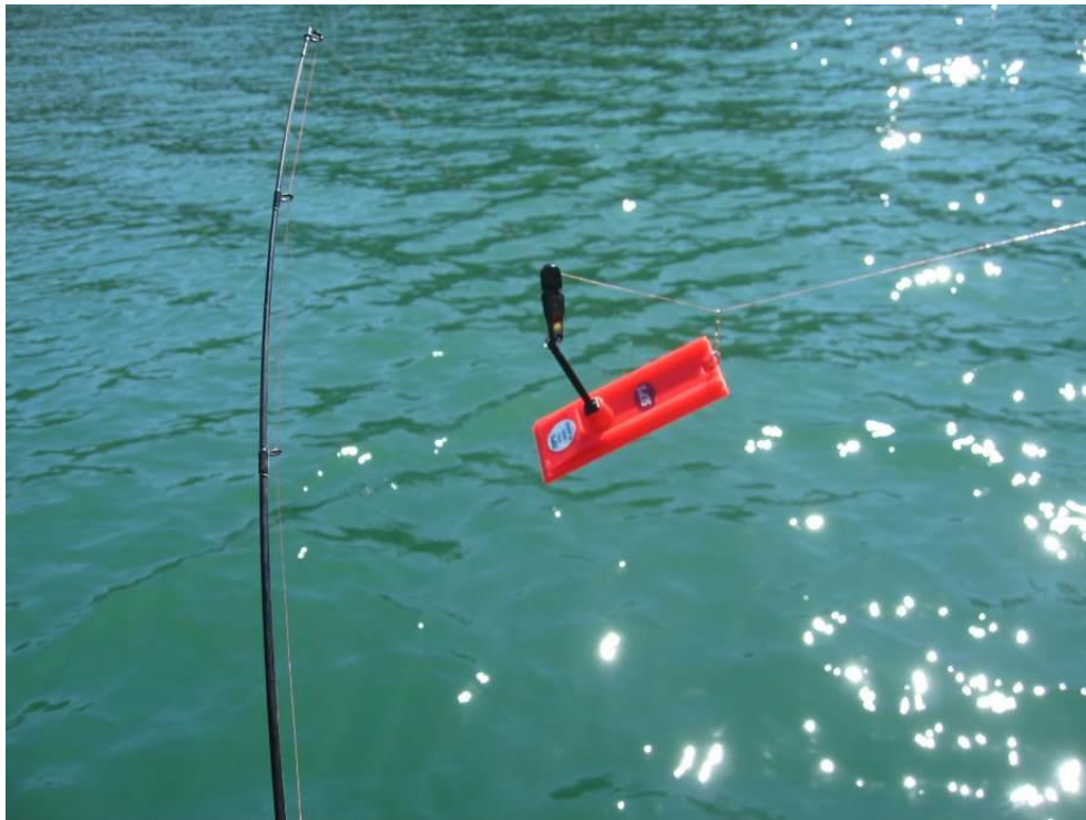
Attach the swivel to the line then attach the Pro Side Planer to the line so the arm is towards the tip of the rod.